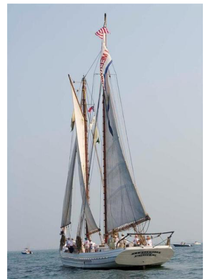
Schooner A.J. Meerwald, home port in Bivalve on the Maurice River, Cumberland County, NJ