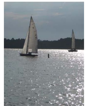
Sailboats on the Choptank River

Talbot, Caroline and Dorchester Counties have hired a multi-disciplined team headed by Lardner/Klein Landscape Architects to assist with this planning effort. Lardner/Klein has prepared corridor plans for Byways throughout the eastern United States and are well known for their collaborative working style. One of the first tasks will be to reach out to members of our communities for their involvement, ideas and suggestions as to how this byway planning effort can help preserve and enhance the heritage tourism opportunities— as well as agri-tourism and eco-tourism – that are abundant in the region.