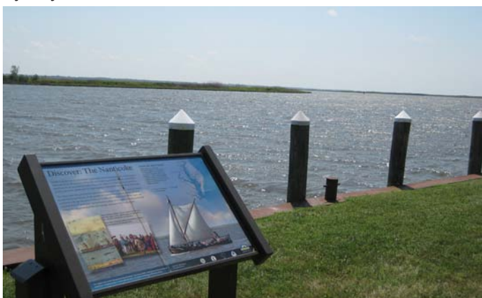
View of the Nanticoke River from Vienna, MD

The plan will help highlight and interpret the region's rich history and accentuate its rural character, maritime culture, and natural resources. Some examples might include strategies for land and resource conservation, the development and marketing of theme-based itineraries, and roadside enhancements to make it easier to find and follow the byway.