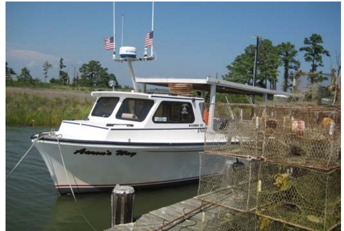
A fishing boat in Dorchester County

Michener's Chesapeake Country Scenic Byway highlights the pristine waterways, historic waterfront villages and wide natural expanses found along a series of scenic roads and historic travel routes in Talbot, Dorchester and Caroline Counties. As the mid-shore section of the Chesapeake Country Scenic Byway, it links such small towns as Easton, St. Michaels, Tilghman Island, Oxford, Denton, Preston, Federalsburg, Cambridge, East New Market, Secretary and Vienna. Visitors learn about and enjoy the rich maritime history and natural resources of the region. From birding to bicycling, to beaches, to boating - Michener's Chesapeake Byway is one way to see and do it all.