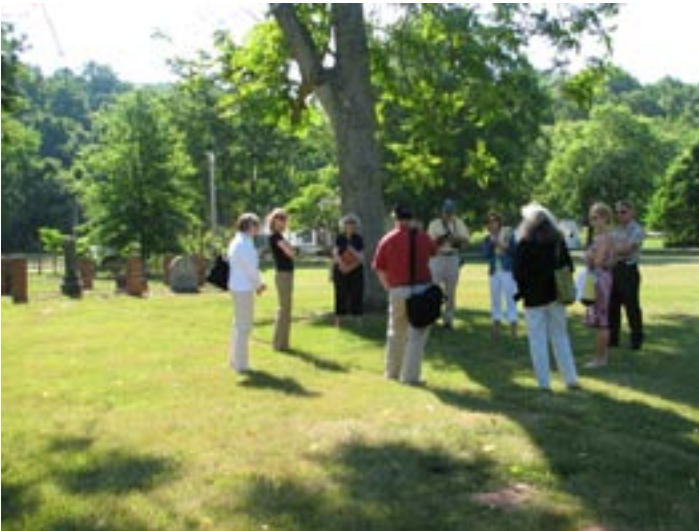
The Religious Freedom Byway Management Team toured the corridor to identify issues and opportunities for management

a grant from the Federal Highway Administration (FHWA) in the amount of $150,400 to develop a Byway Management Plan (BMP) for the Religious Freedom Byway.