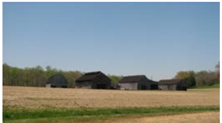
Preservation of Southern Maryland's tobacco heritage is a strong priority in the region

The preparation of the Byway Management Plan is the first step in coordinating Smart Growth Initiatives and creating a partnership with all federal, state and local agencies and programs to preserve, maintain and enhance the Byway's character-defining features.