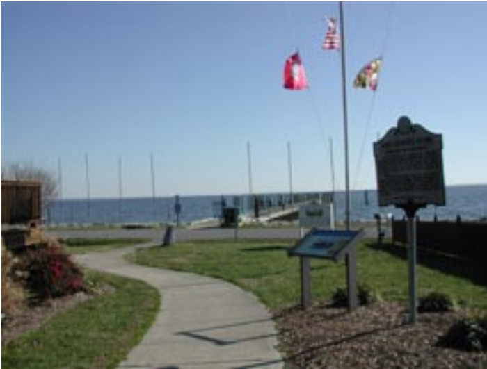
St. Clements Island celebrates the birthplace of Maryland

This chapter of the Byway Management Plan summarizes the purpose of the plan and the process that was utilized to develop the plan.