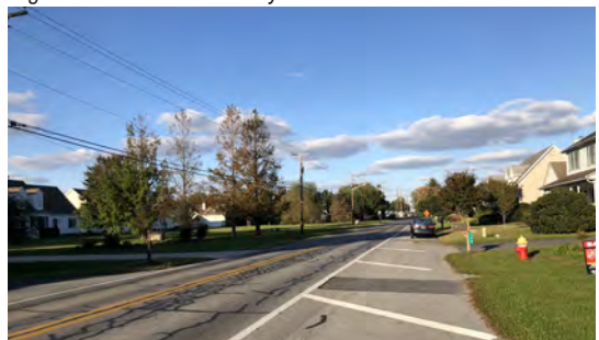
Figure 3 New Road approaching 4th Street