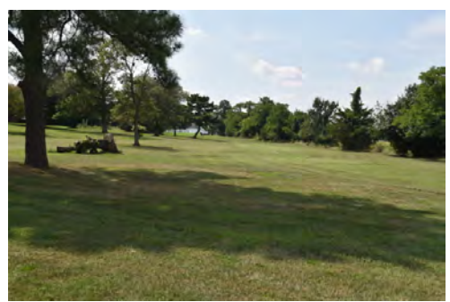
Figure 6 New Road view looking north near Blue Heron Drive