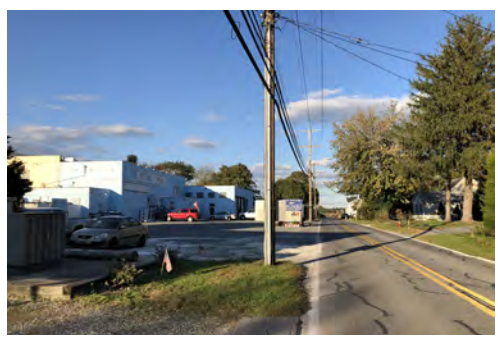
Figure 8 New Road looking east toward Pilottown