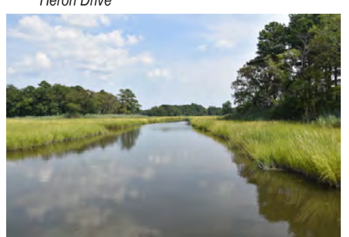
Figure 7 New Road view of Canary Creek