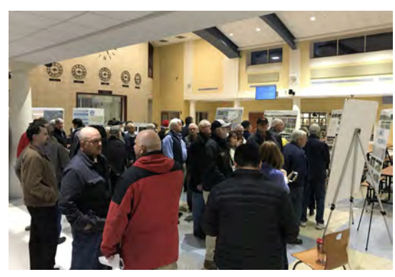
Figure 4 New Road Corridor Master Plan public meeting